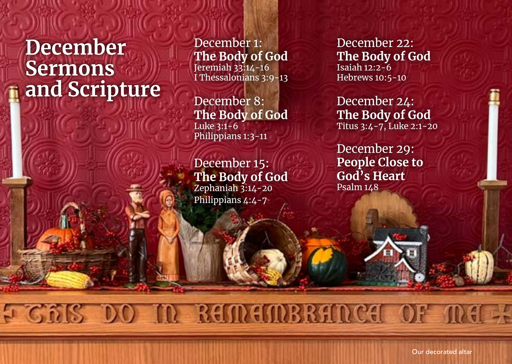
Our decorated altar

December 29: People Close to God's Heart Psalm 148