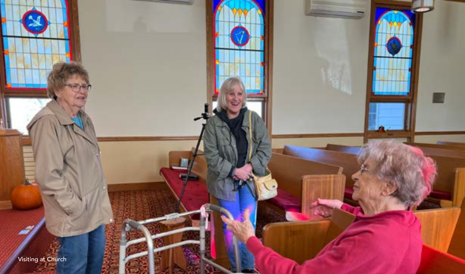
Visiting at Church