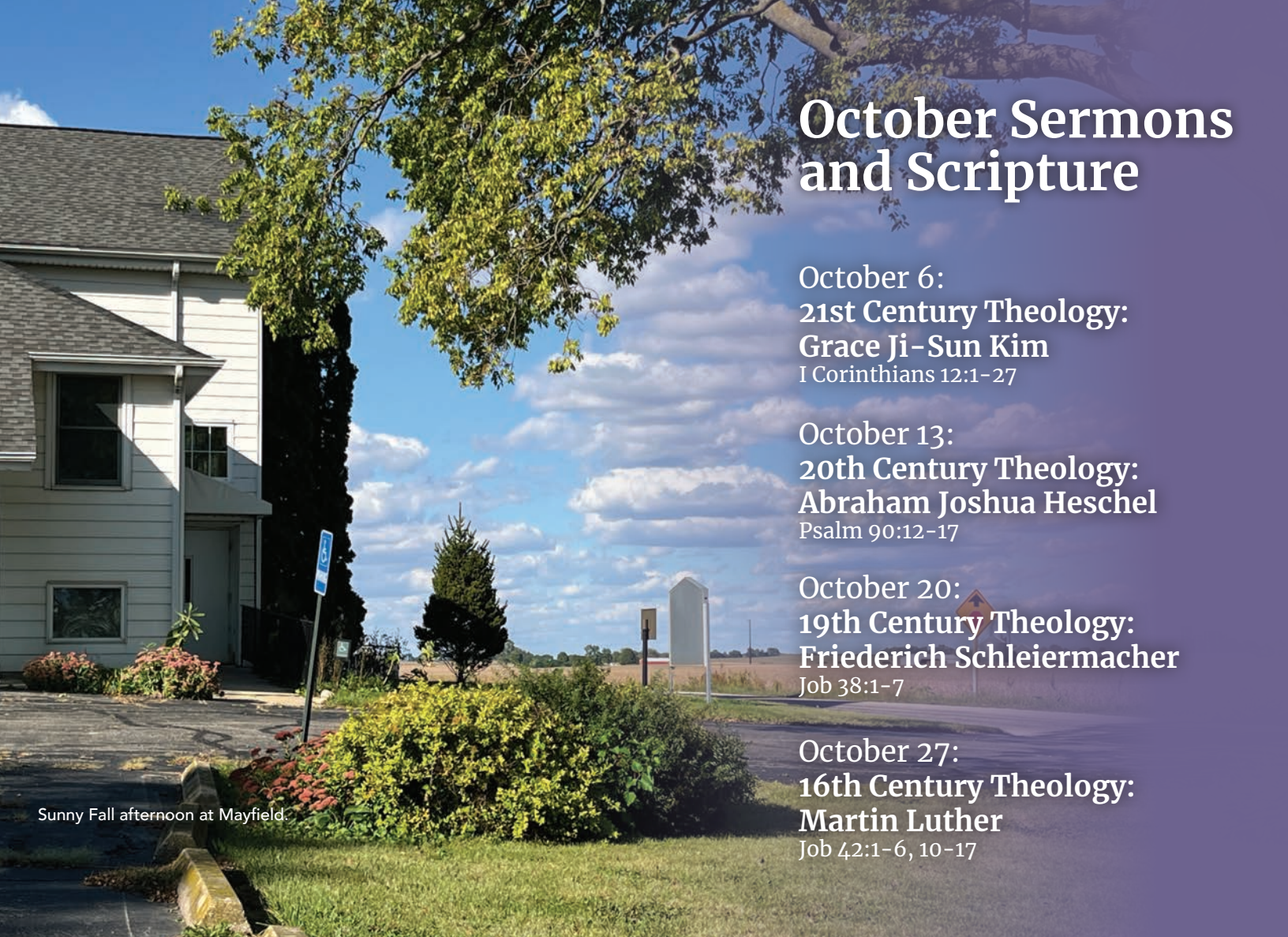
Sunny Fall afternoon at Mayfield.