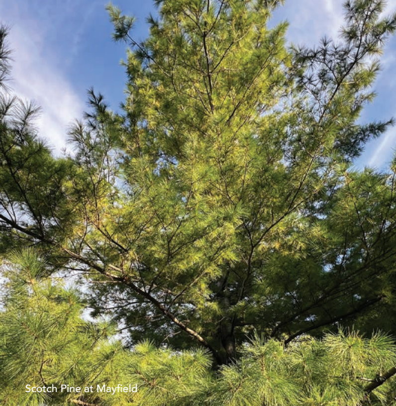
Scotch Pine at Mayfield