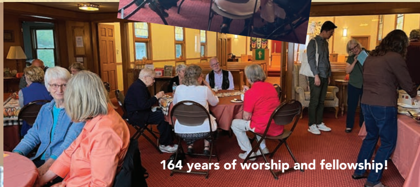
164 years of worship and fellowship!