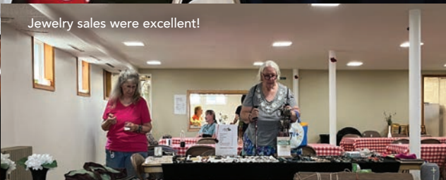
Jewelry sales were excellent!