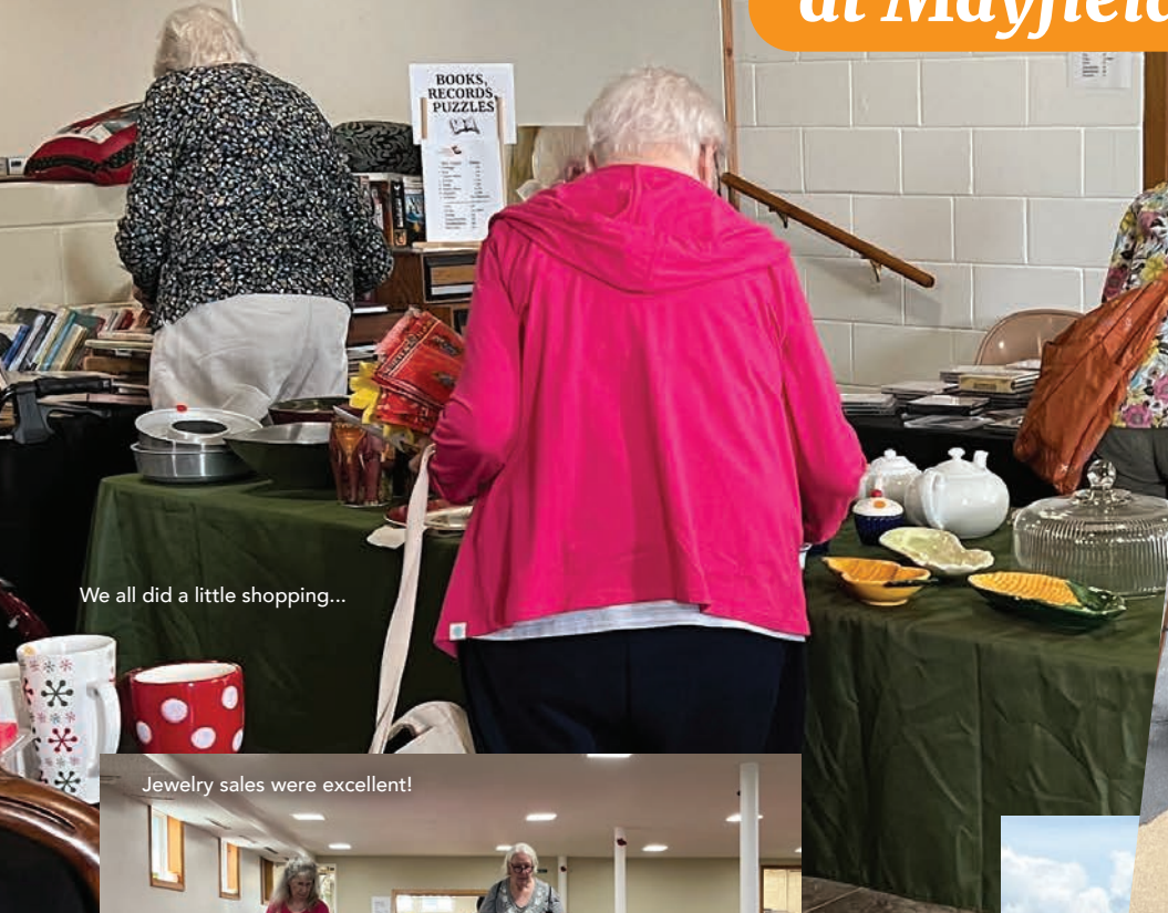
We all did a little shopping...