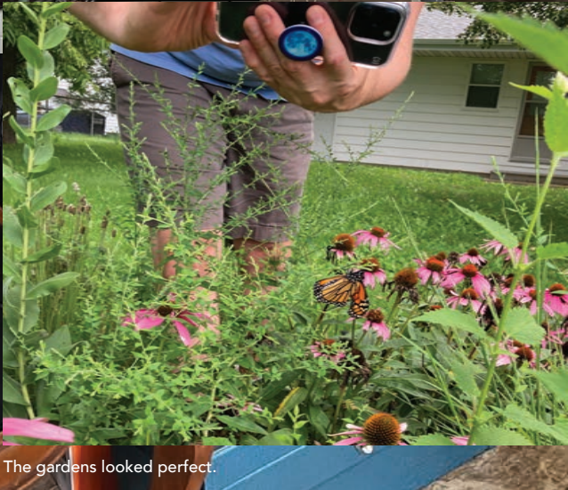
The gardens looked perfect.