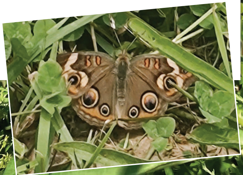
A monarch and a common buckeye at the way station