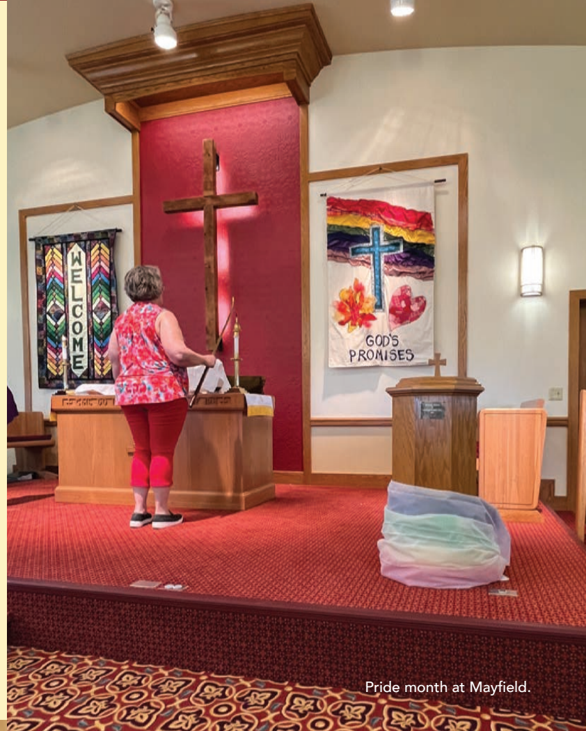
Pride month at Mayfield.

The National Ministries and the Pension Boards partnered to provide additional resources to make the promotion of planned giving more accessible in your congregation. We created a new website where people can create (or draft and take to their lawyer) a will. The site prompts people to consider a charitable gift in their estate, but it doesn't require it. You can learn more about this resource by visiting www.freewill.com/ucc .