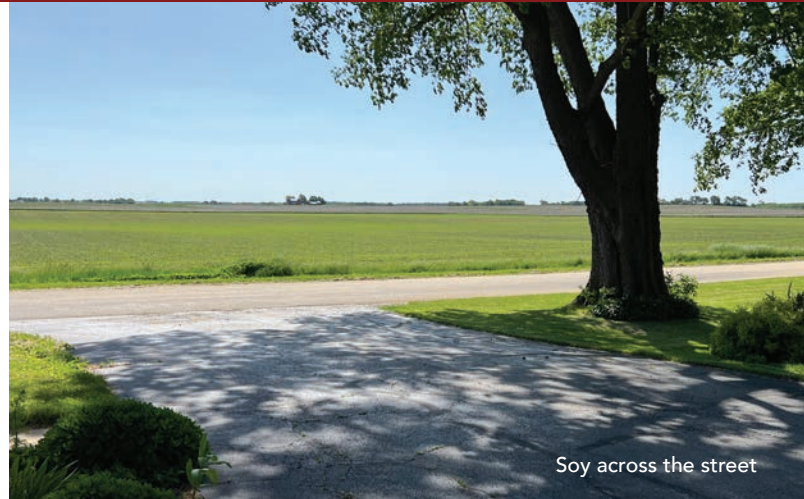
Soy across the street