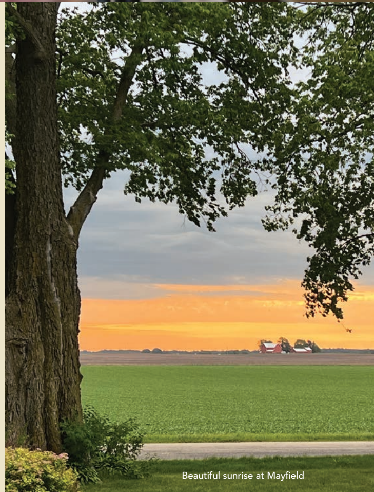
Beautiful sunrise at Mayfield