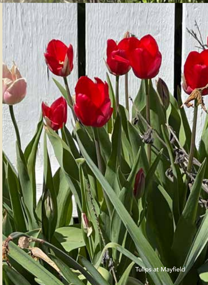
Tulips at Mayfield