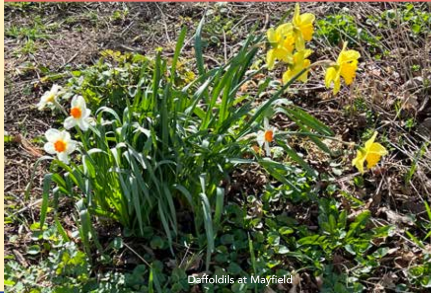
Daffodils at Mayfield