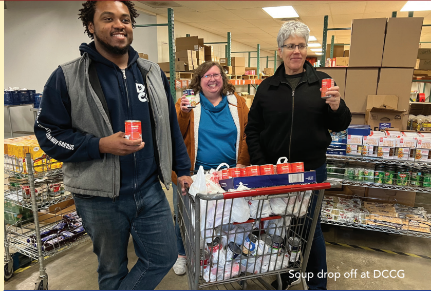
Soup drop off at DCCG