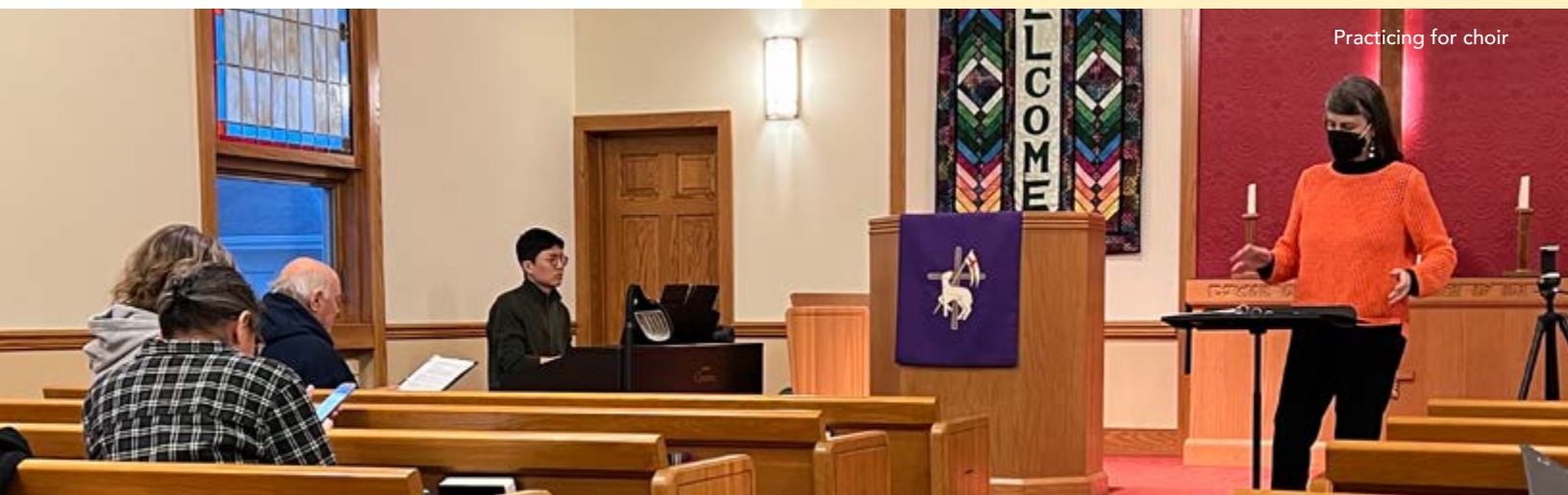
Practicing for choir

If your donation is for our "Preservation Fund", please indicate so.