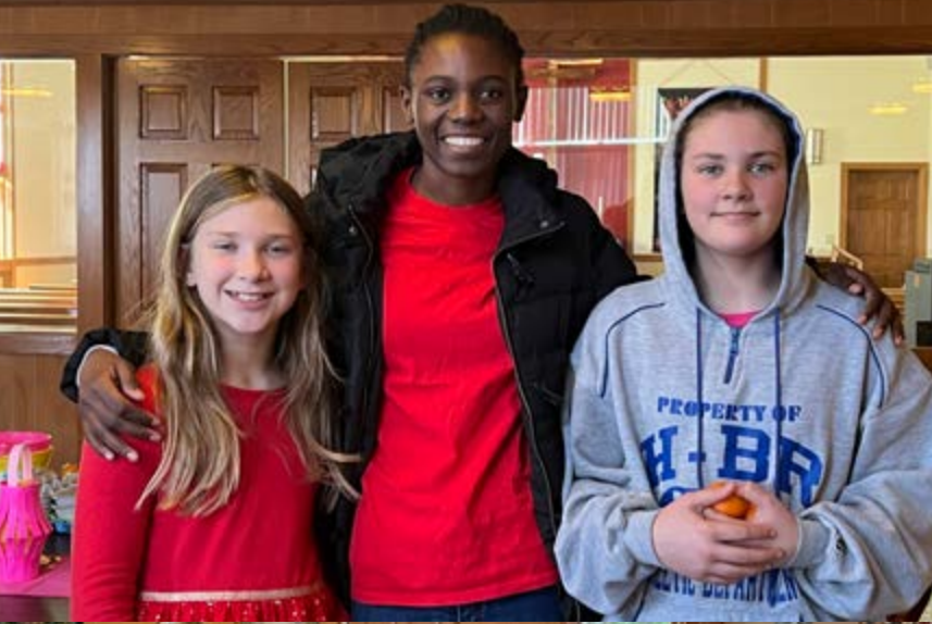
Meeting a friend from JAMS!