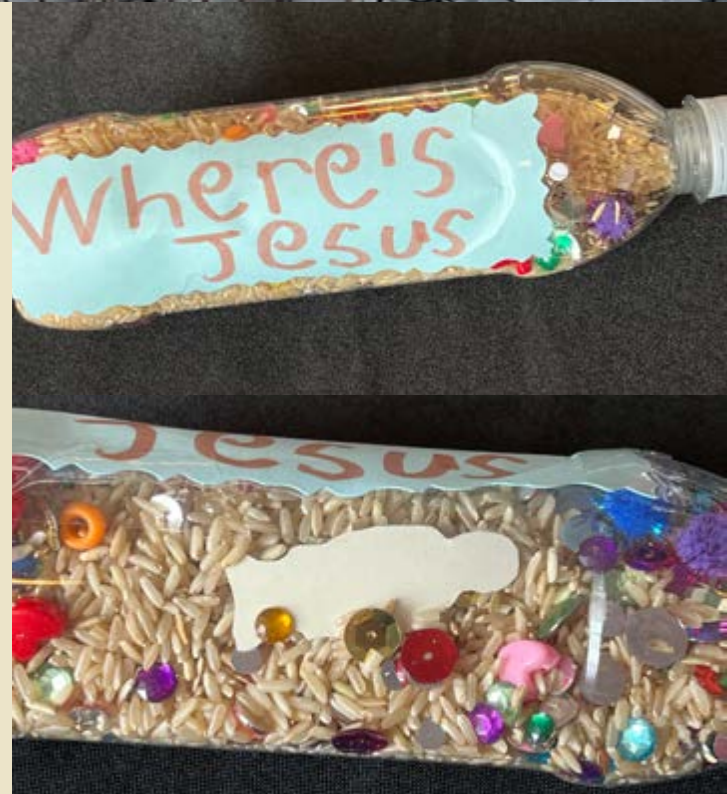
Finding Jesus at Mayfield.