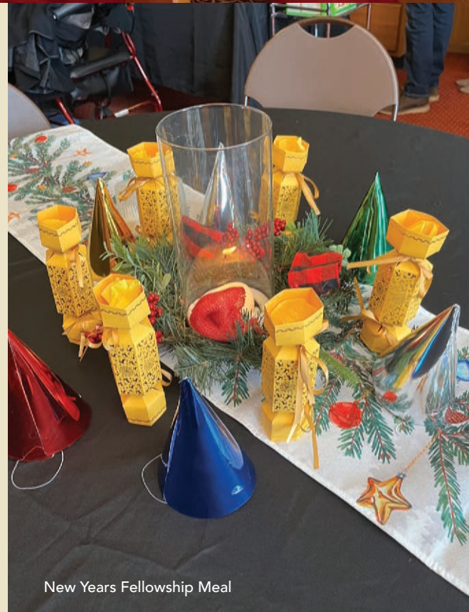
New Years Fellowship Meal