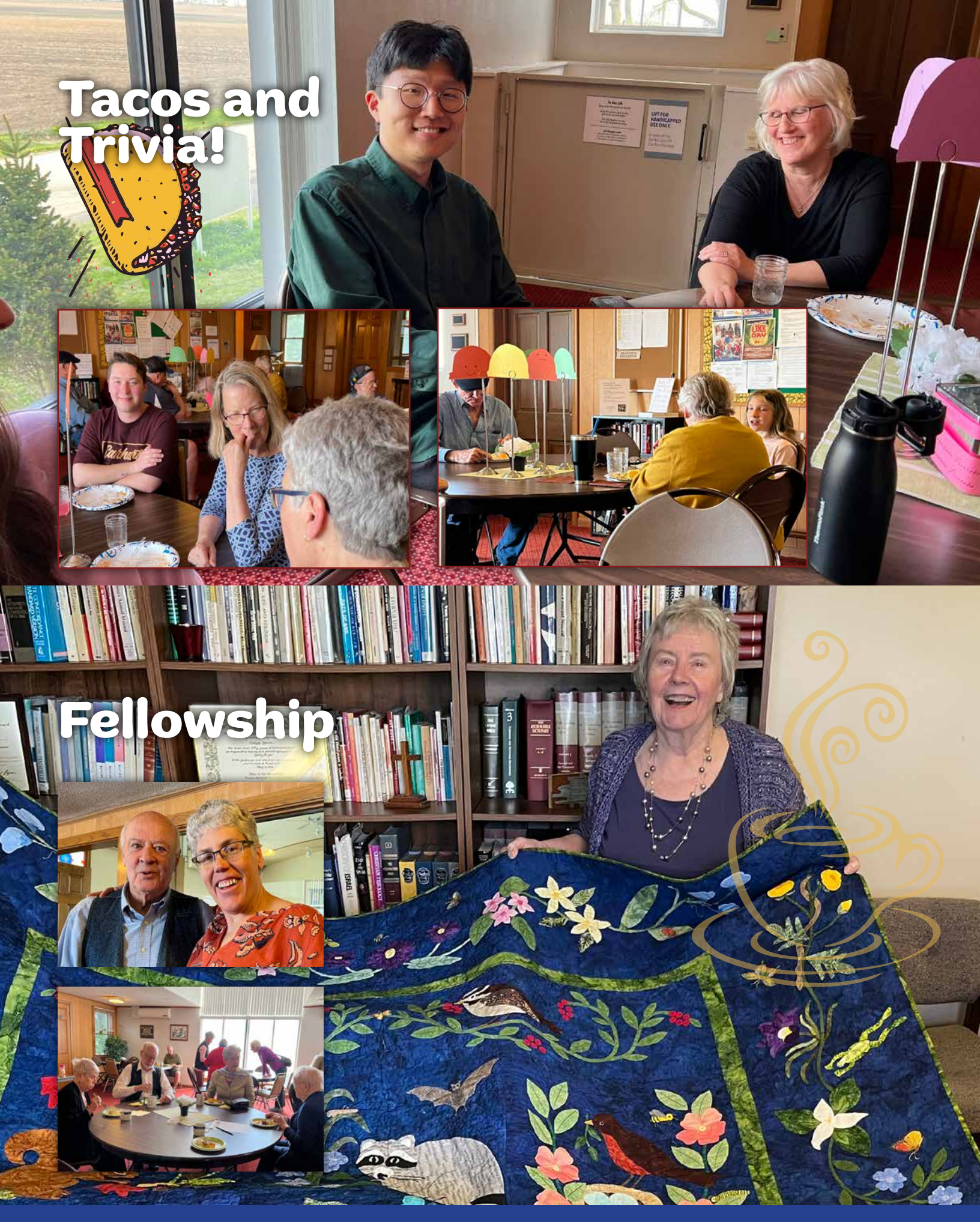
June 2023 | Mayfield Congregational Church Newsletter