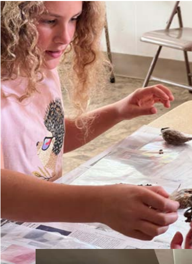
Making milkweed planting balls for religious education.