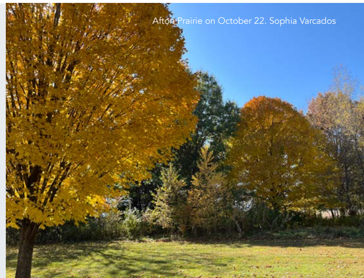
Afton Prairie on October 22. Sophia Varcados