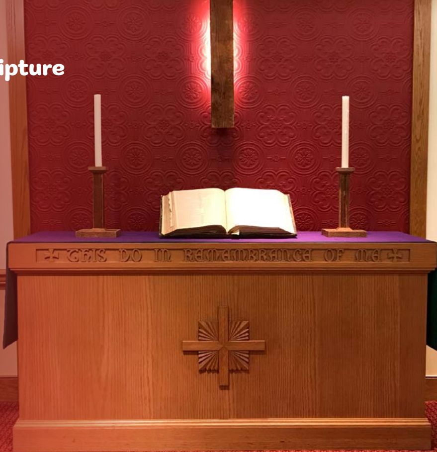
Altar at Mayfield

(Jeremiah 32:1-3a, 6-15) In the Sanctuary