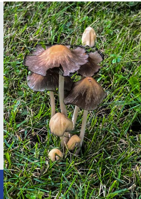
Mushrooms growing on Mayfield lawn.