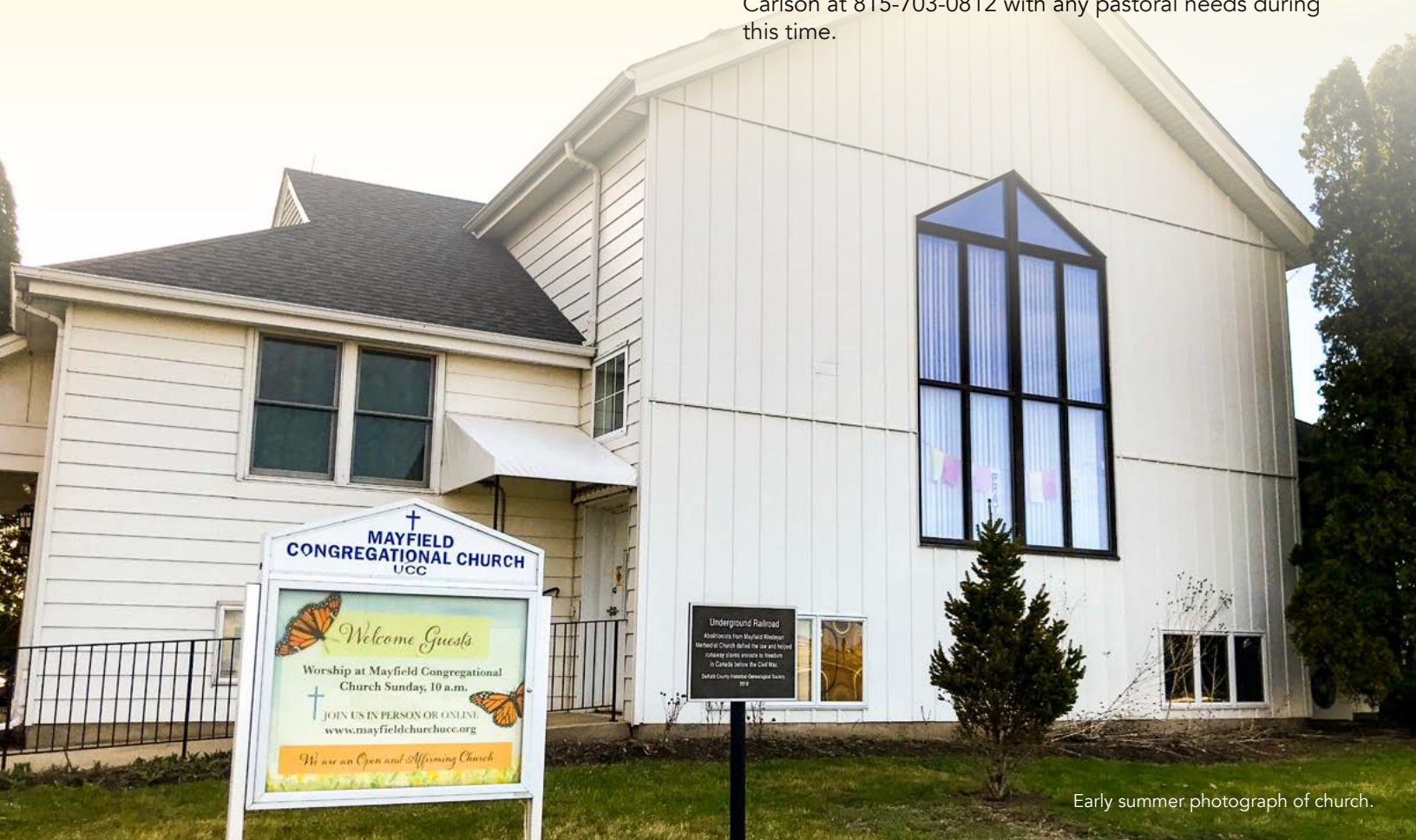
Early summer photograph of church.