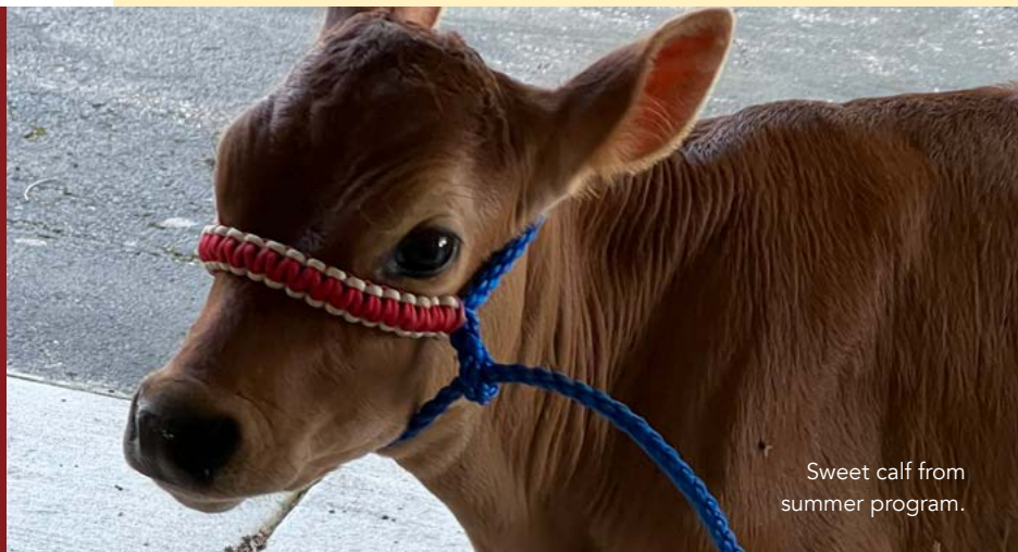
Sweet calf from summer program.