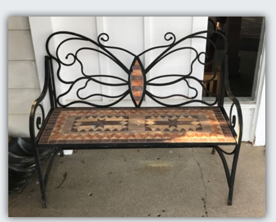
Mayfield Butterfly Bench