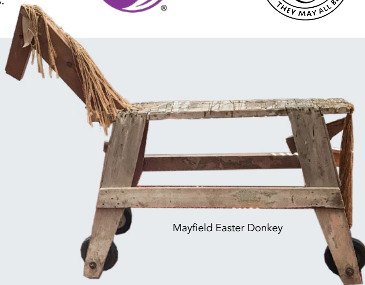
Mayfield Easter Donkey