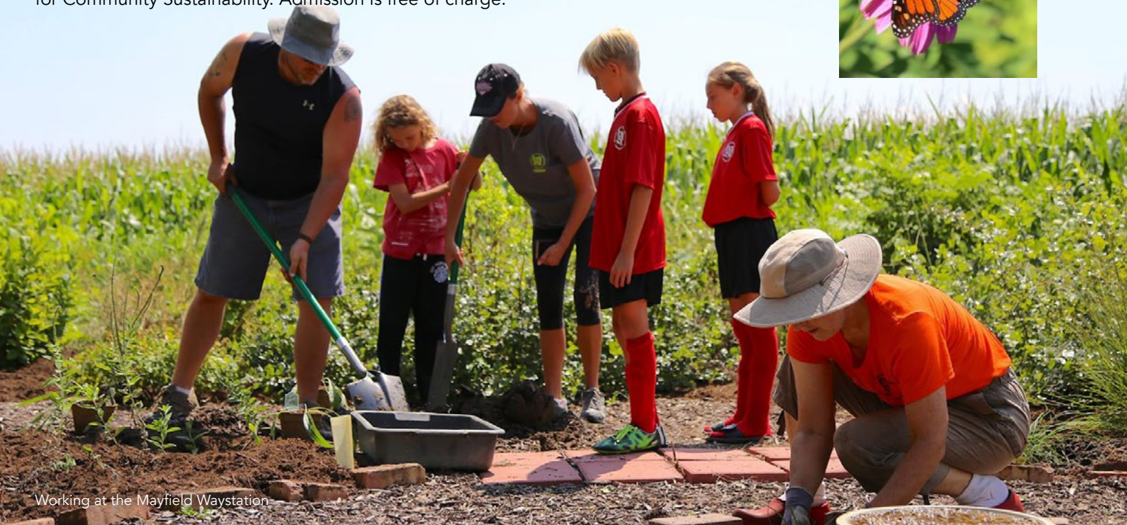
Working at the Mayfield Waystation