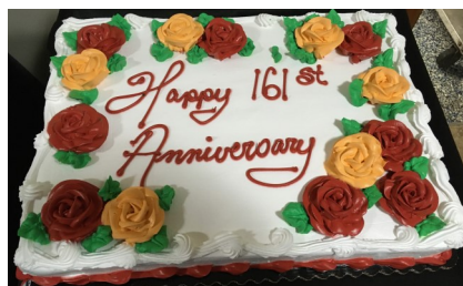
Installation and Anniversary Celebration October 24, 2021