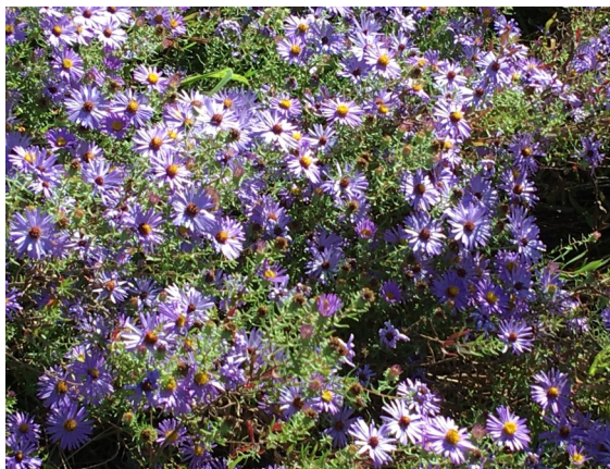
9/26/21—The Waystation flowers were still blooming!

What an exciting time to celebrate our past and to look forward to where God might lead us in the future! I'm so glad we will be continuing the journey together. Stand with me, stand with each other, as we call out for God to continue to send light and truth to guide us. And we will respond to God with exceeding joy—O God! My God!